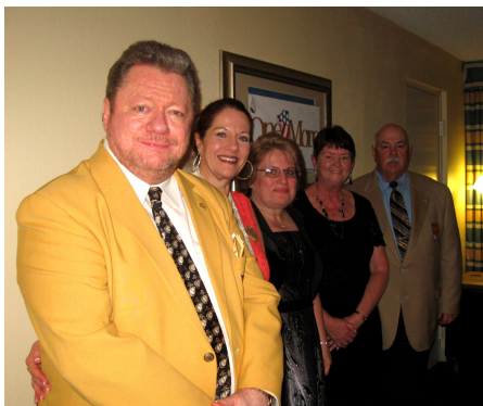
The Meet and Greet party was a fun time and was packed all night, but what do you expect? It was something free.