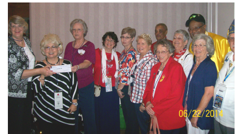
A nice check was presented from the Voyageurs and Dames of Georgia to the Hobo Children's Party Project.