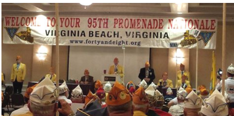
General meeting, business session

Grand du Georgia was well represented, if my calculations are correct, we had 14 Voyageurs, 12 Dames and one visitor. I think everyone who attended had a good time, seeing old friends and meeting new friends. Just some highlights below.