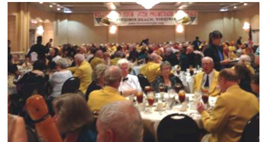
Full house enjoyed the Banquet and Program