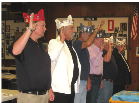
Dito of the rest of the Charter Officers.