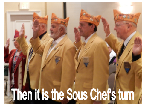
Then it is the Sous Chef's turn