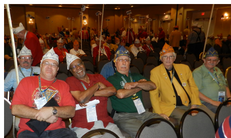
Part of the rowdy Georgia Bunch where was the rest of them.

Grande du Georgia received a plaque for 2 nd place in the Dwindell Wharton Trophy. This is awarded annually for the Grande with the largest % of new or reactivated Voitures.