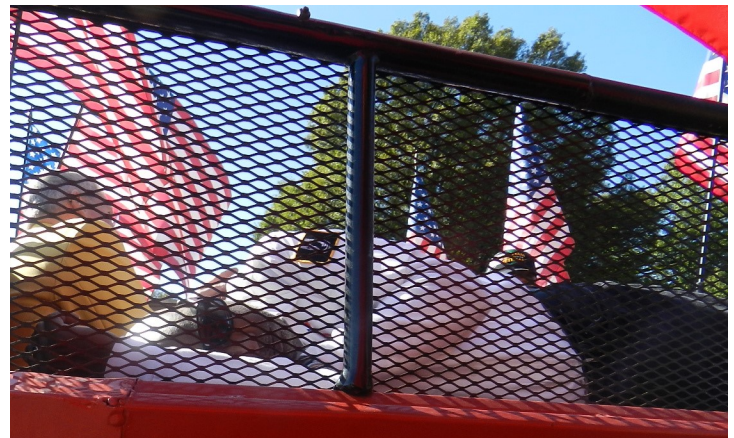
It's tough waiting on the parade to start! Sweet dreams Hiram.