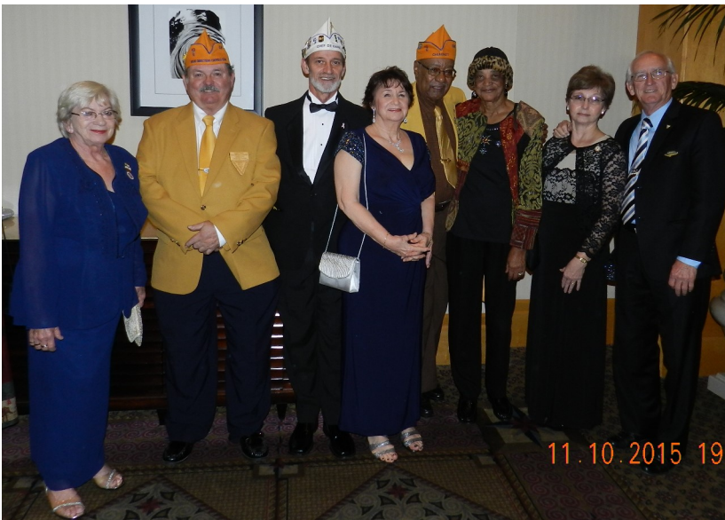
The Georgia delegation at the National Veterans Day awards banquet in Birmingham, AL.