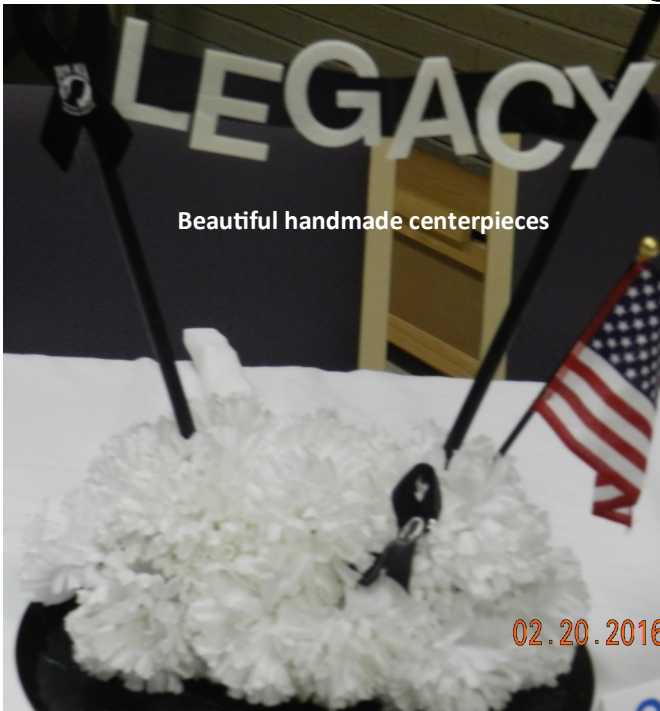
Beautiful handmade centerpieces