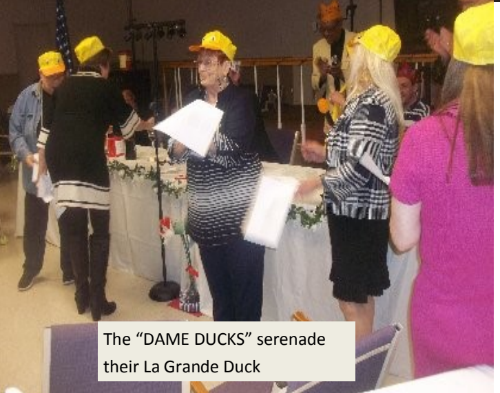
The "DAME DUCKS" serenade their La Grande Duck