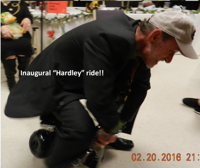
Inaugural "Hardley" ride!!