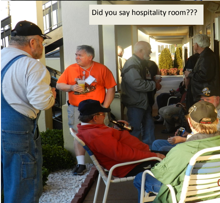
Did you say hospitality room???