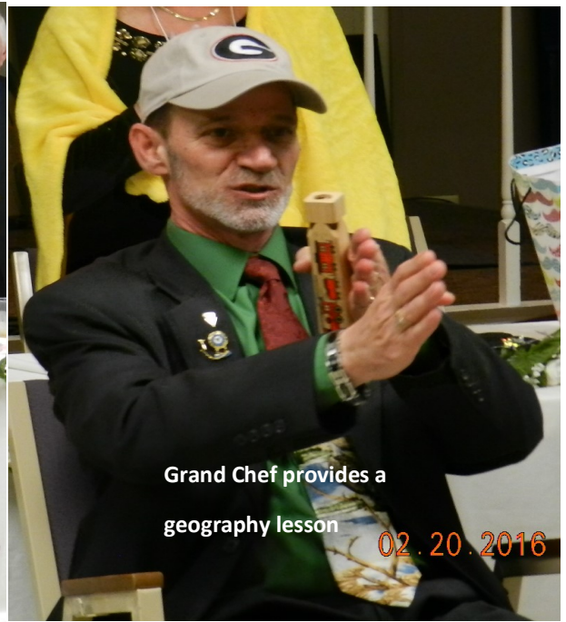
Grand Chef provides a geography lesson