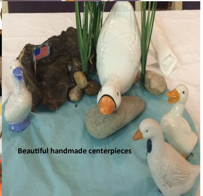
Beautiful handmade centerpieces