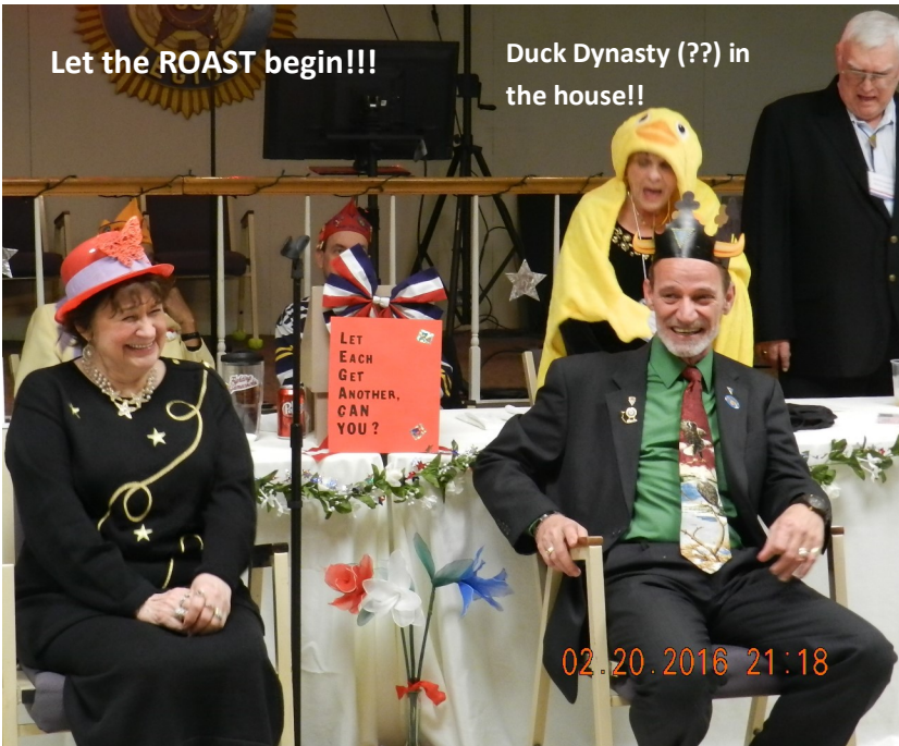
Let the ROAST begin!!!