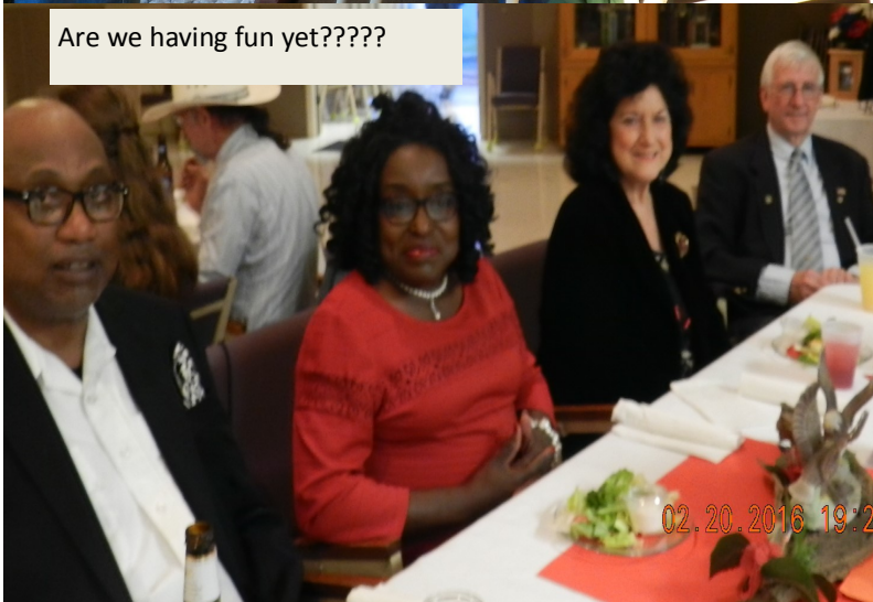
Are we having fun yet?????