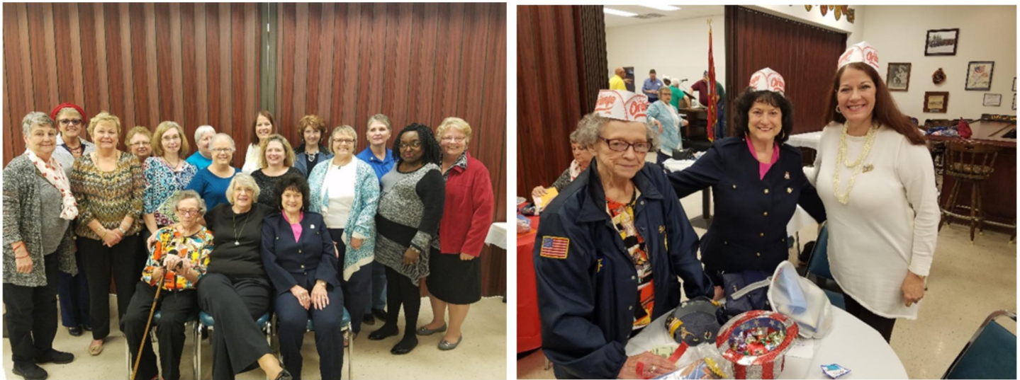
Picture of the Grande de Georgia Dames at Mid-Winter Cheminot held at V-217, Atlanta, GA.