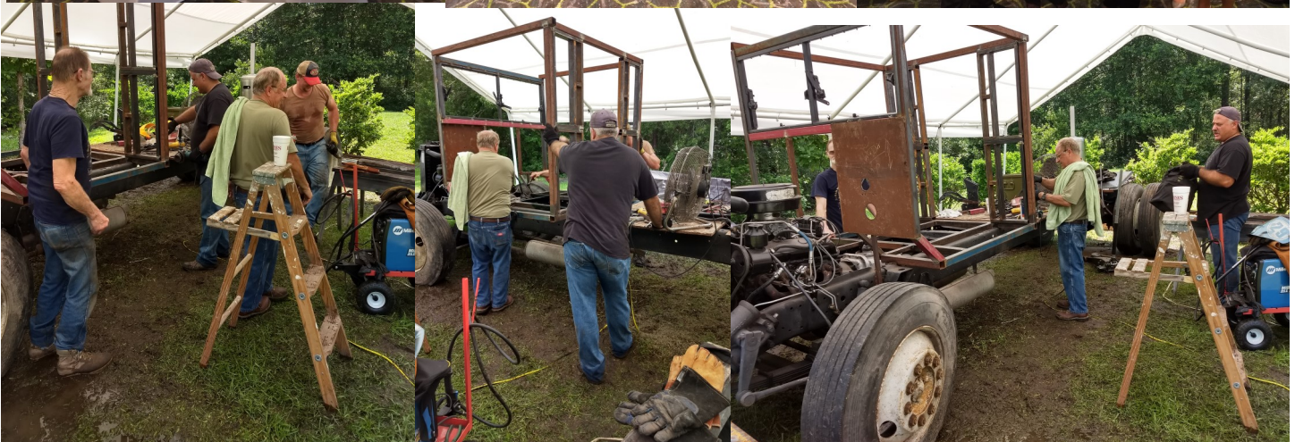
Voiture 567 Savannah hard at work building their new Train